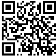
Patriots' Path Council's Scouting Safely Website