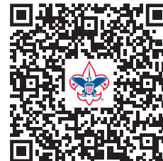
BSA Age-Appropriate Guidelines

1 Saddle Road Cedar Knolls, NJ 07927 Office: 973-765-9322 Fax: 973-267-3406