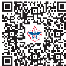
BSA Incident Reporting Website