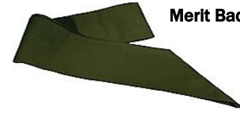
Merit Badge Sash