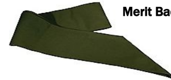
Merit Badge Sash