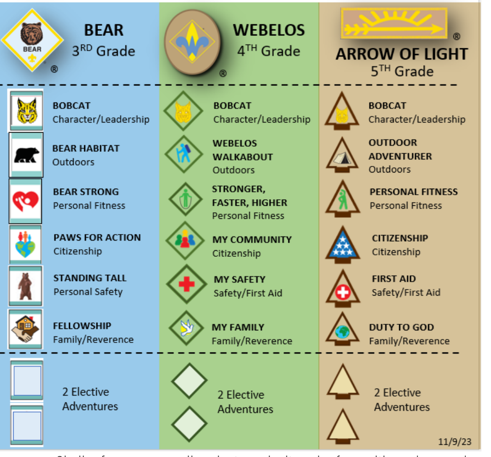
Similar focus across all ranks to make it easier for multiage dens and pack-wide activities.