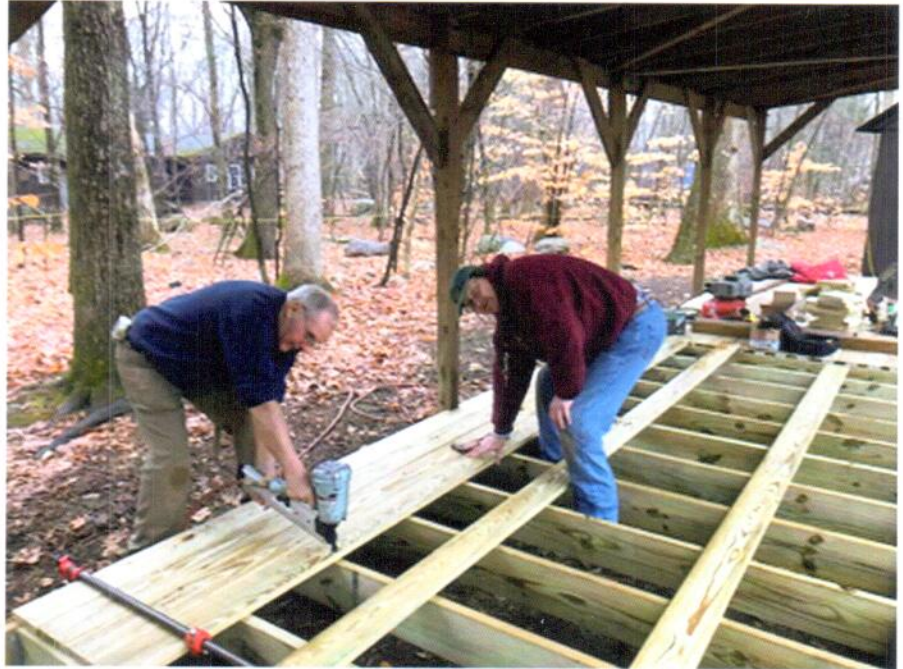
Building New Archery Range Deck

In 2017, the Flintlocks put in 5819 man hours working on projects at the camps. Our goals are to maintain this type of dedication to help improve and maintain the camp facilities. In 2018 we hope to keep up this dedication.