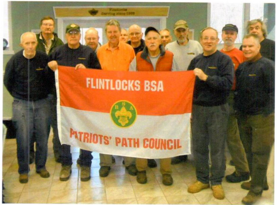
Some of our members with our new flag